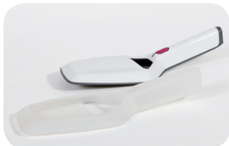
iD Hand Bumper